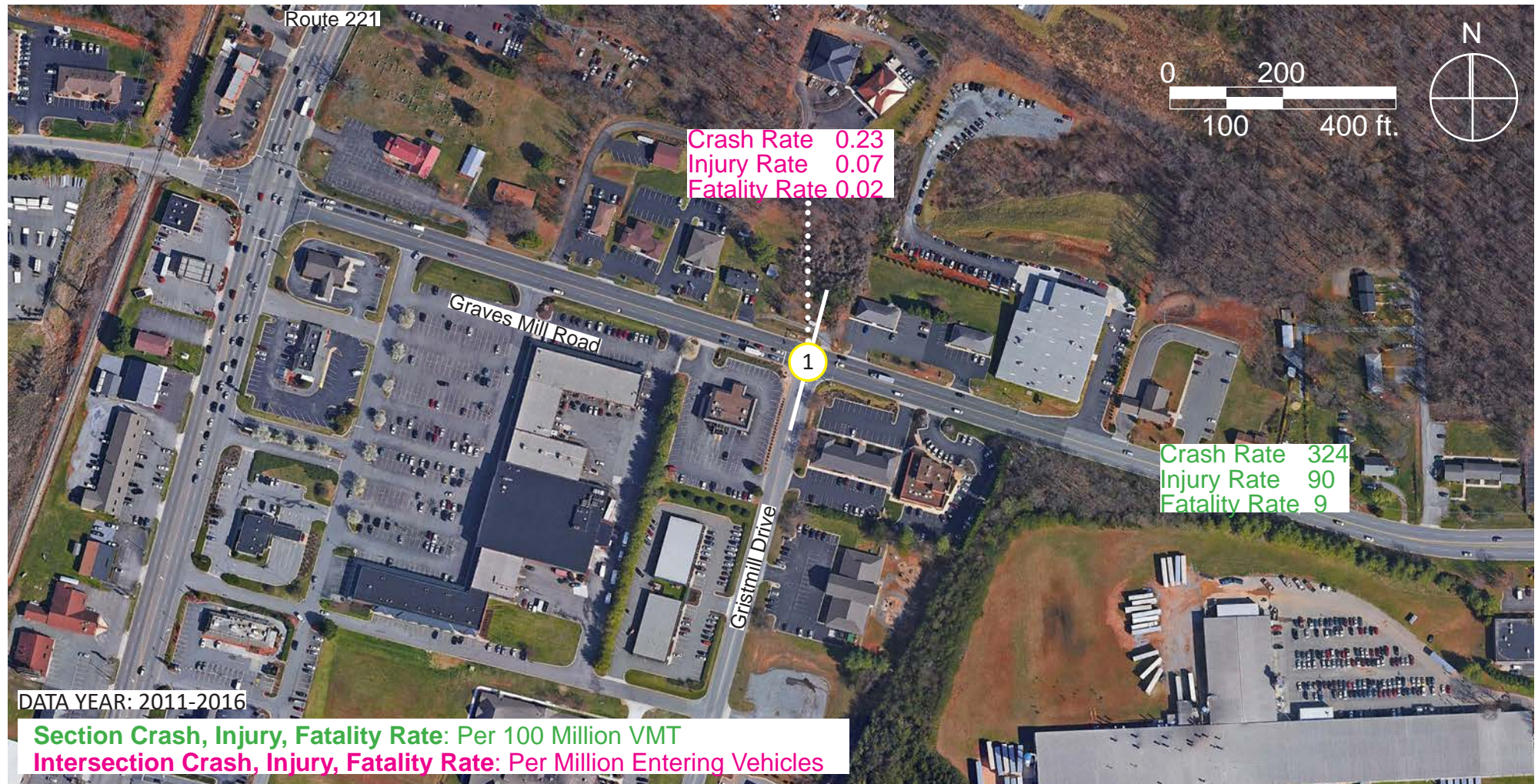
Figure 2-A Crash Rate Illustration